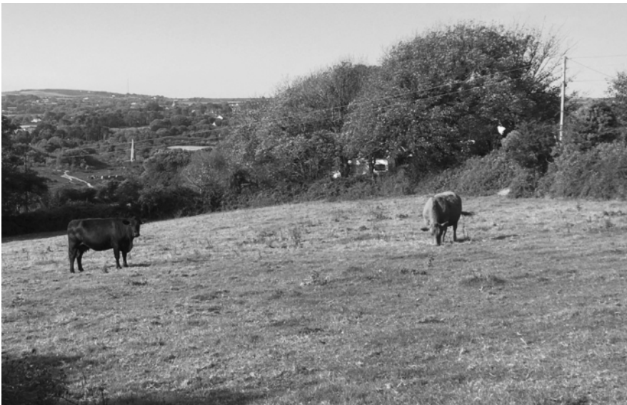
View from Twelve Heads Road, looking across the Poldice Valley towards Carn Marth

On a pleasant morning , with a little light rain and sunny spells, 11 Walkers and 1 Dog, assembled in the Village Carpark at 9.15am ready for a 9.30am departure. We headed up Church Hill, briefly pausing at the layby by the Parish Church to enjoy panoramic views of the village. Then on up Church Hill, passing Chacewater House, and 2 more houses on the left until we arrived at the bridleway. A broad open track also used by agricultural vehicles which passes through a patchwork of small fields, the last section of the path as it approaches the Twelve Heads road, narrows considerably, but has recently been cleared so access is good.