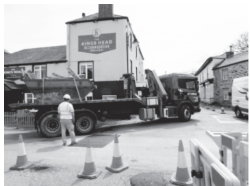
1st vehicle over repair

The water main repair was finished and the road re-opened just after the evening rush on Friday. On Monday, Cormac's Highway crews came to restore the damaged eastbound road surface.