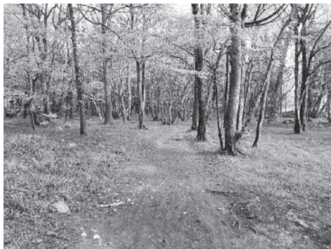
Our magical Unity Woods and its beautiful display of Bluebells

CRoW walking group had one specific objective in mind this month, which was to take what has become something of an annual pilgrimage to Unity Woods, where the most wonderful ground cover of bluebells can be seen around this time of year. A longer walk, if compared to most we take on, we were not disappointed though and a black and white photograph will never do the place justice, especially at this time of year!