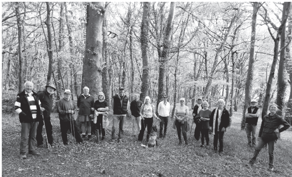
The CRoW walking group take a well-earned rest at the entrance to Unity Woods, near Falmouth Road

The next CRoW walk leaves The Square Car Park at 0930 on Sunday 6th June 2021 and is for everyone.