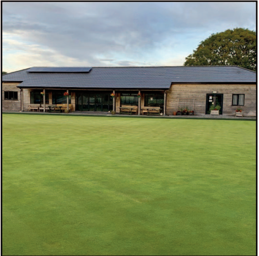
Chacewater Bowling Club