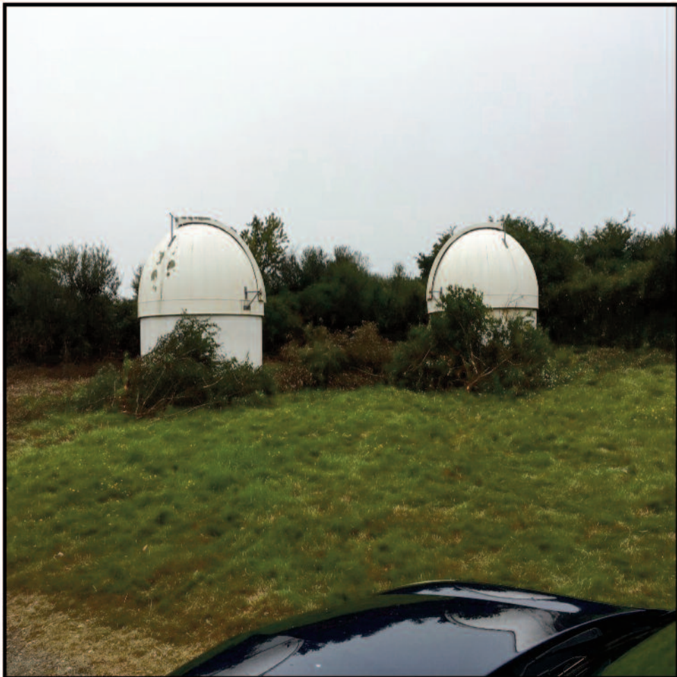
Cornwall Observatory at Wheal Busy