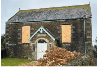
Wheal Busy Chapel

With all this in mind, I find myself considering that I used to feel that it was a terrible shame all these buildings on our doorstep, with their so-called English heritage listings, were slowly but surely disappearing in front of our eyes. And it won't be that long before there will be nothing to show of all this history; just like the Californian stamps, of which all there is to prove they ever existed is a few wooden stumps.