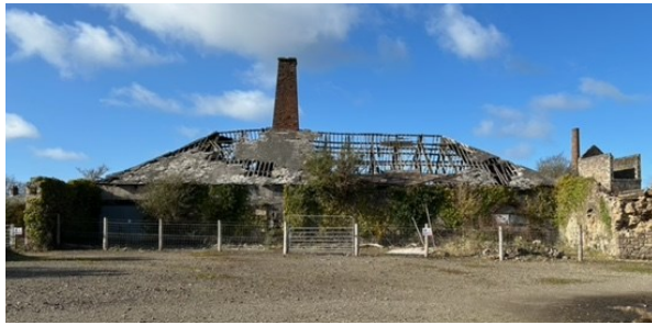
The Old Smithy

He felt that the Cornish were possibly blinkered with a romantic view of our past, in the way in which we regard our heritage of working in the mining industry. He commented that in reality the majority of folk back then who toiled down the mines or in the associated buildings lived